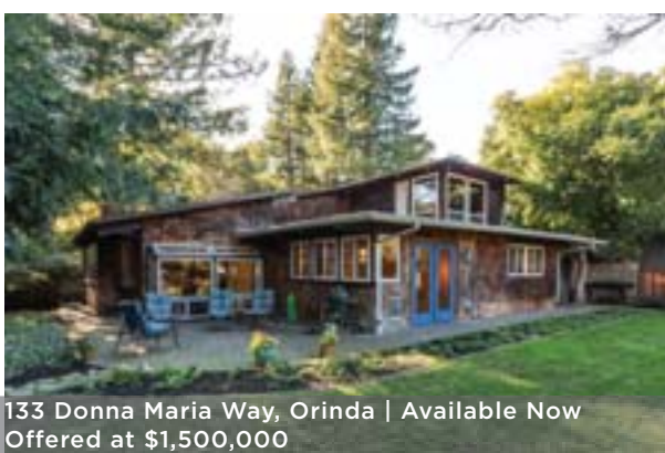
3+ Bed | 2 Bath | 2,285 Sq. ft. / .24 Acres 3D tour at www.DonnaMariaWay.com