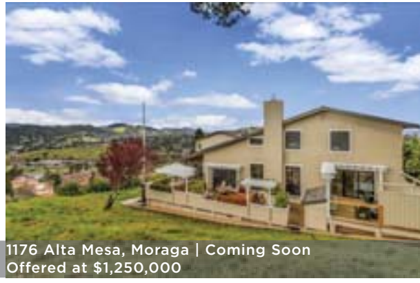
4 Bed | 2.5 Bath | 2,785 Sq. ft. 3D tour at www.1176AltaMesa.com